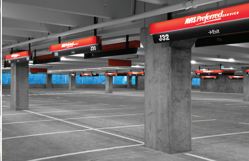
First-of-its-kind multi-story QTA enabled by precast solution.