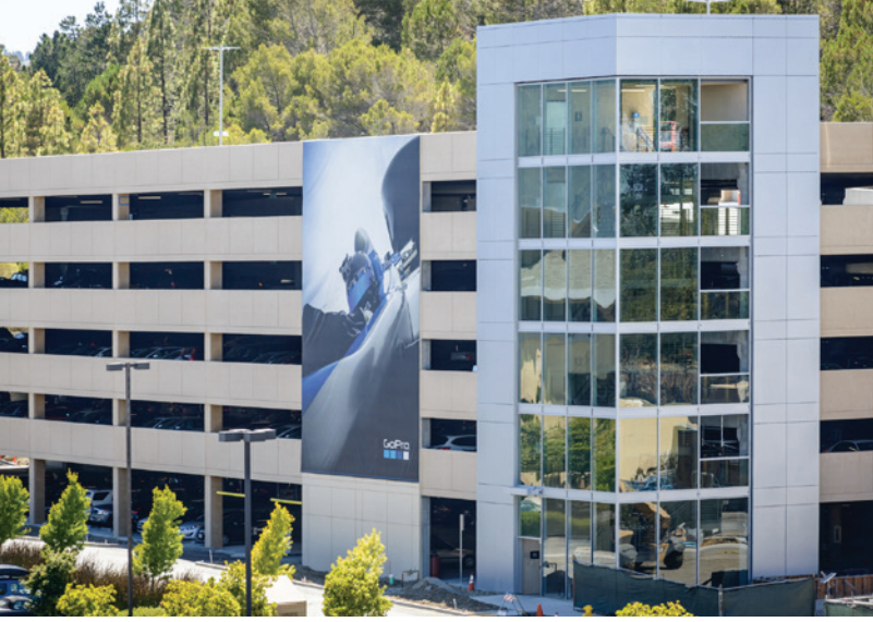
GoPro Headquarters Parking Structure — San Mateo, CA