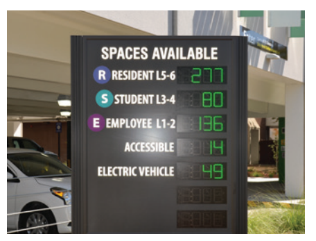
Intergration of a Wayfinder was added due to the project being built below budget.

A hallmark of prefabrication is that it inherently breaks down silos across design-build disciplines and brings team members together early on to focus on the design and constructibility. Prefabrication steered conversations with MEP and other subcontractors early, leading to a fully integrated team, and resulting in a more efficient design layout with innovations not realized in traditional construction methods.