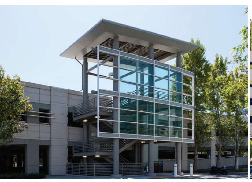
Google Moffett Park Parking Structure — Sunnyvale, CA