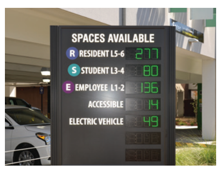
Intergration of a Wayfinder was added due to the project being built below budget.

A hallmark of prefabrication is that it inherently breaks down silos across design-build disciplines and brings team members together early on to focus on the design and constructibility. Prefabrication steered conversations with MEP and other subcontractors early, leading to a fully integrated team, and resulting in a more efficient design layout with innovations not realized in traditional construction methods.