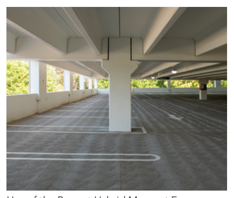
Use of the Precast Hybrid Moment Frame gave the structure an open plan for safety.