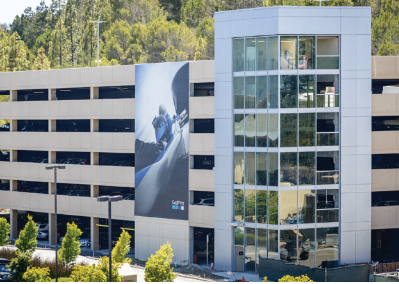
GoPro Headquarters Parking Structure — San Mateo, CA