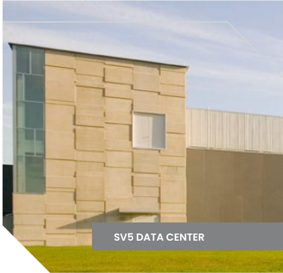
SV5 DATA CENTER