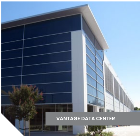
VANTAGE DATA CENTER