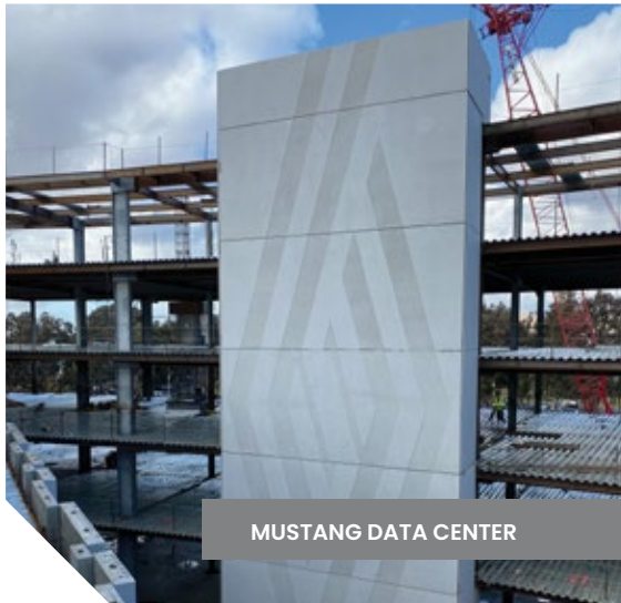
MUSTANG DATA CENTER