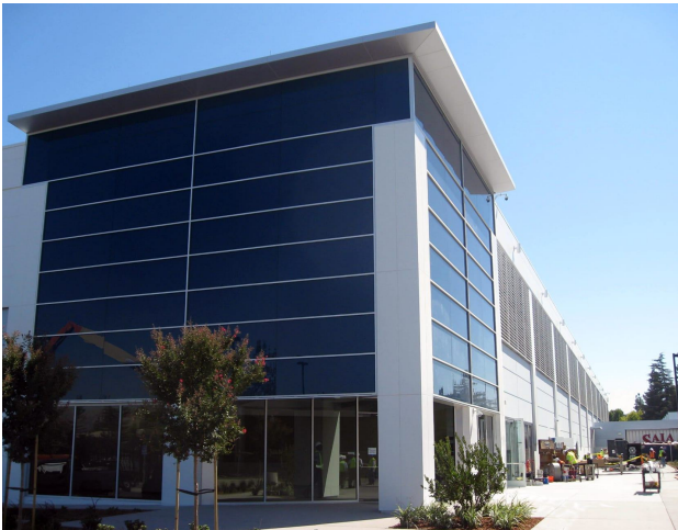
MUSTANG DATA CENTER