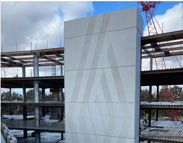
VANTAGE DATA CENTER